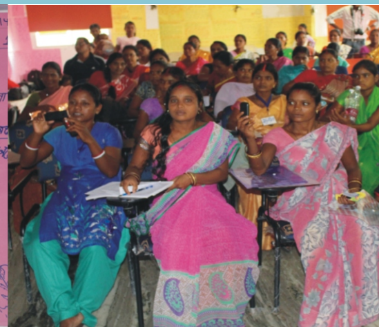
ToT on Transforming Active Women to internal CRPs.