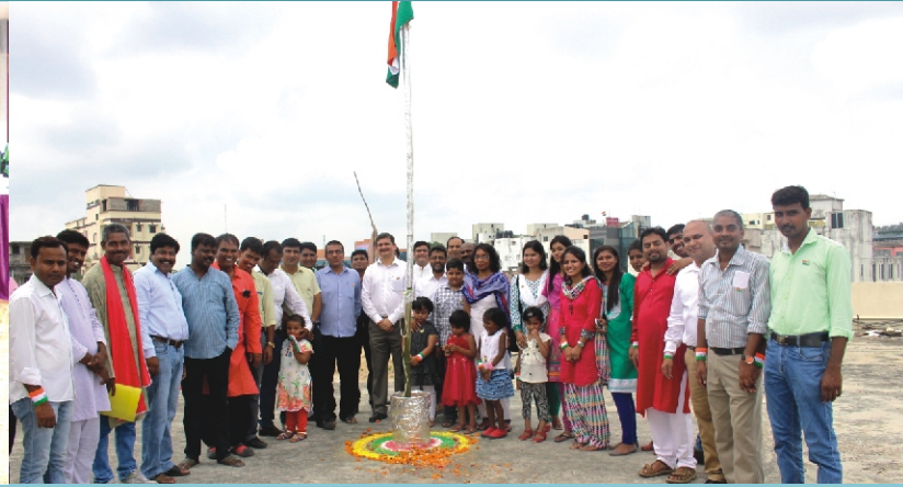
Celebration of 69th Independence Day at SMMU, JSLPS