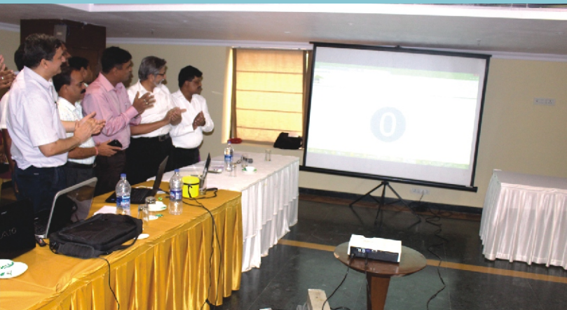
Launching of HR MIS at Le Lac, Ranchi