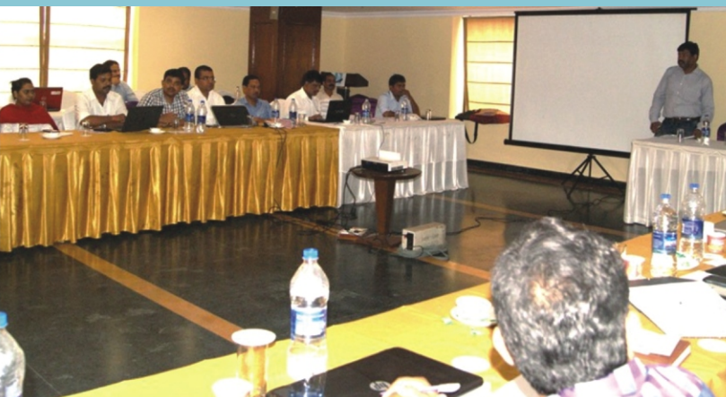
Quarterly Review Meeting of DMMU at Le Lac, Ranchi