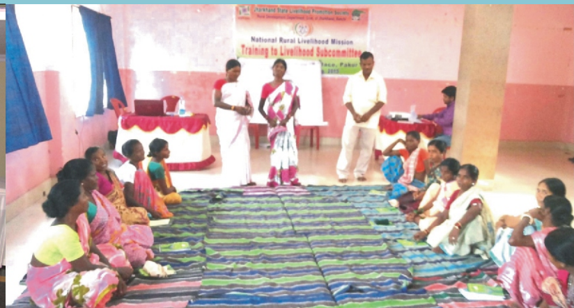
Livelihood Sub-Committee Training at Pakur