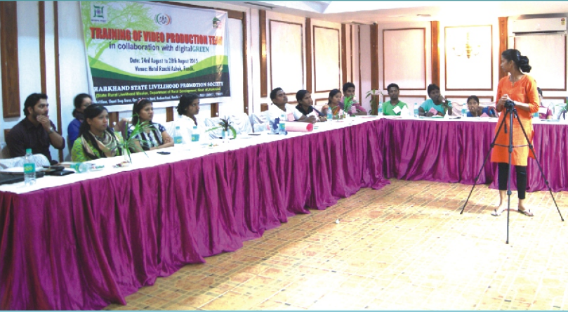
Capacity Building Exercise of Community Cadres on Video Documentation