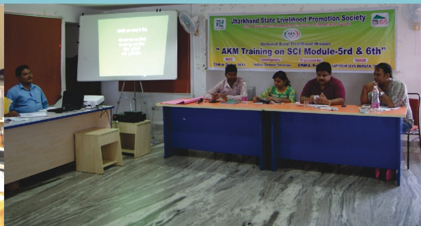
Training of AKMs on SCI at Saptrishi, Ranchi