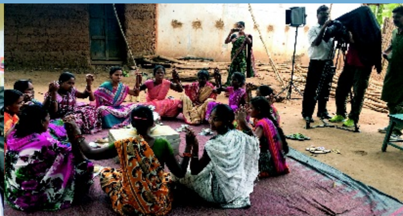
Shooting in progress for JSLPS Corporate movie