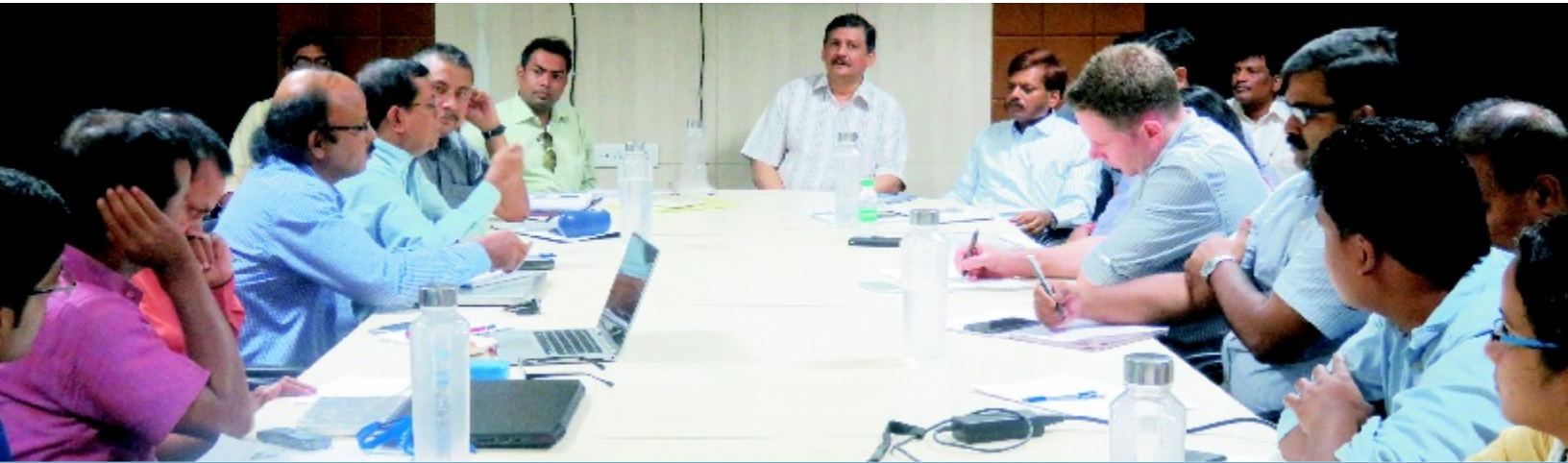
Brainstorming with World Bank team for Johar Project