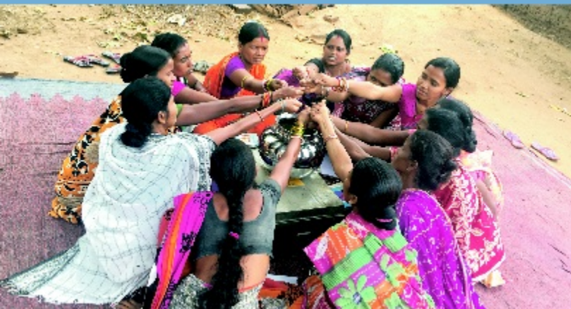
SHG members of Pakur district practicing 'Ek Muthi Chawal' activity