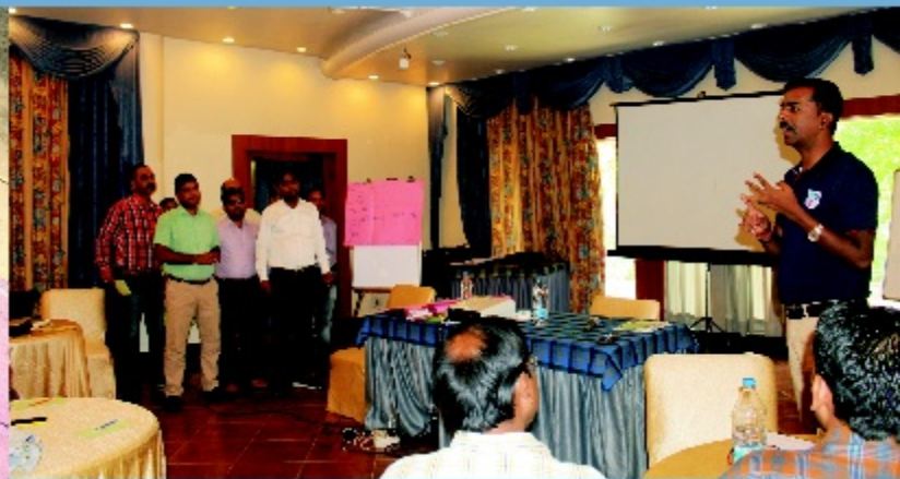
Finance Review and Planning meeting at IBIZA Resort, West Bengal