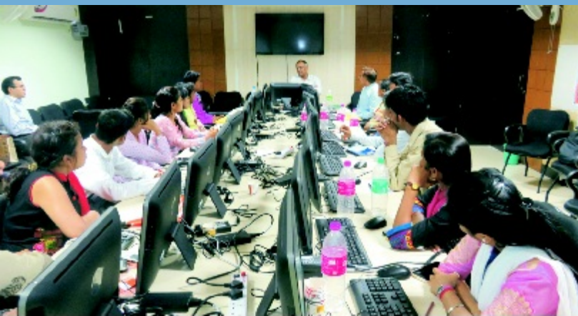
English ToT to English Trainers of PIAs