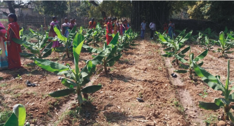
Aajeevika Krishak Mitras training on Banana Cultivation at Angara