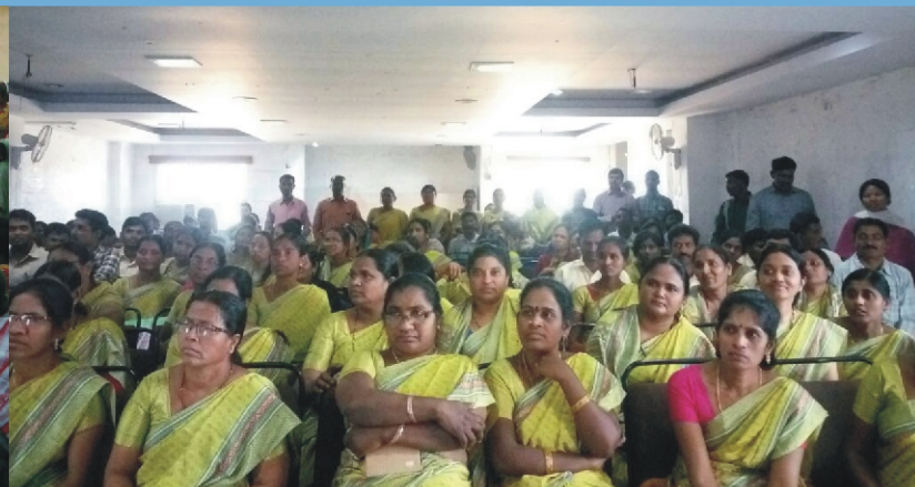
18th round CRPs briefing meeting with 42 CRPs teams from NRO APSERP