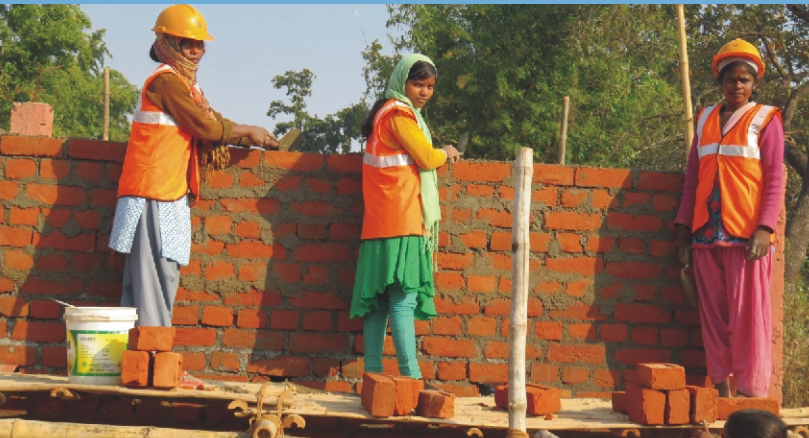
Masonry training provided to the members of Village Organizations by JSLPS