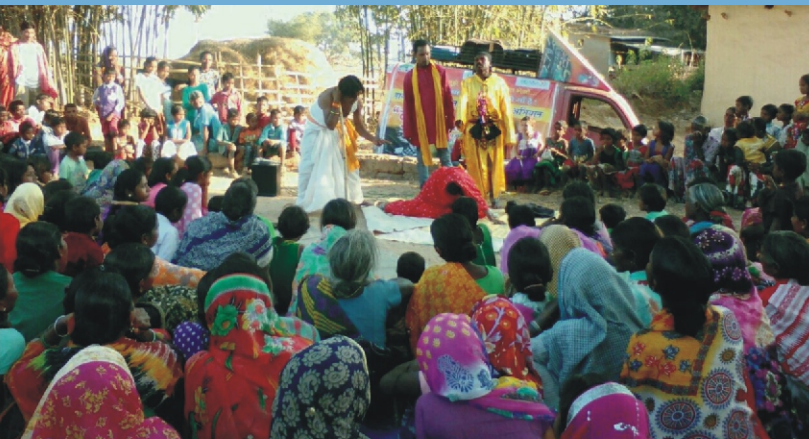
Street Play against Witch Hunting and Human Trafficking