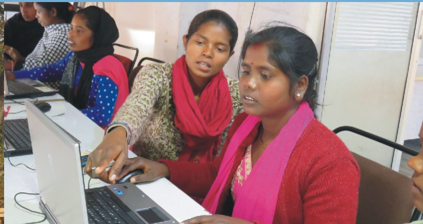
Step towards making the members of Aajeevika Sakhi Mandal Digitally Empowered