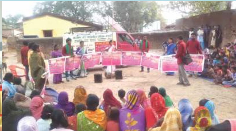
Creating awareness about community insurance through street play