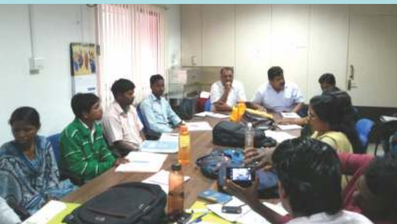
MEC Review Meeting at DMMU Ranchi