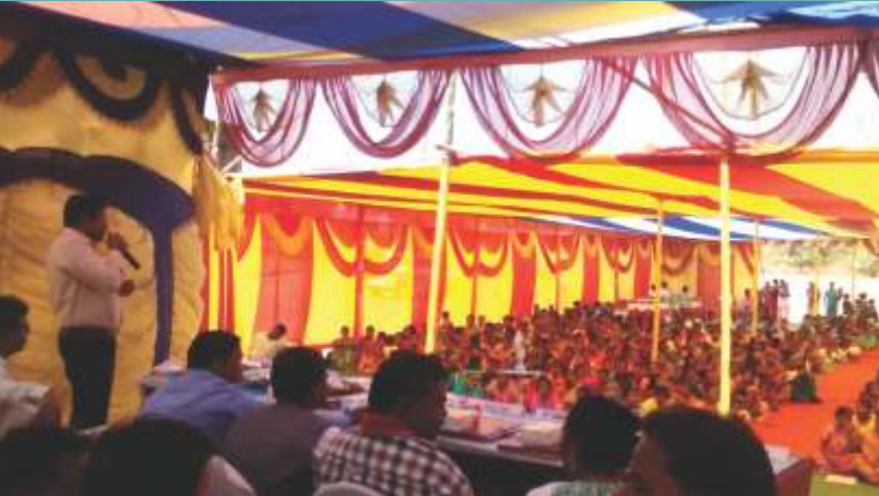
"Ajeevika Krishak Mitra" Sammelan at Angara