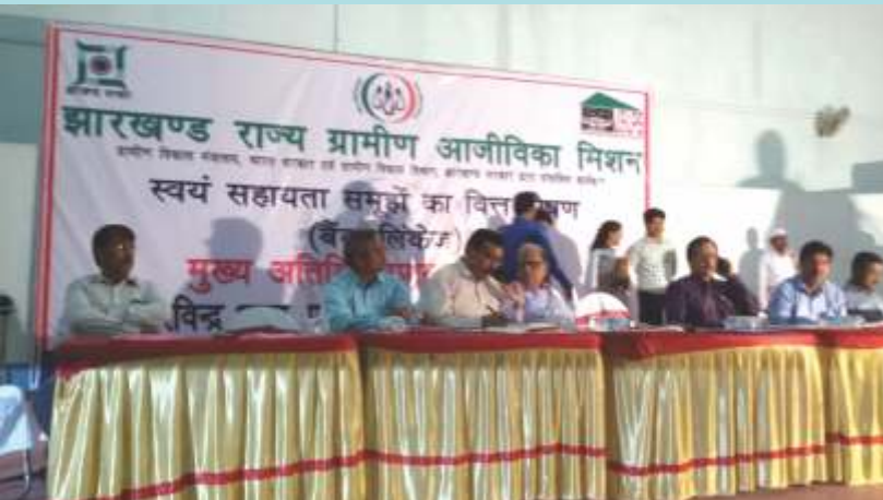
Credit Linkage camp in Pakur