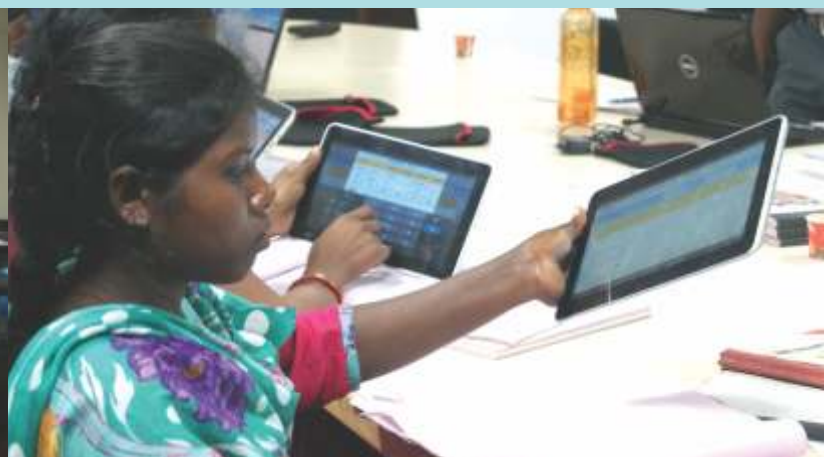
MIS Training of SHG Book-keepers at Ranchi SMMU

An Initiative of Knowledge Management & Communication Cell