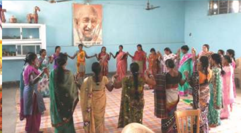
Book-keepers training in West-Singhbhum DRDA